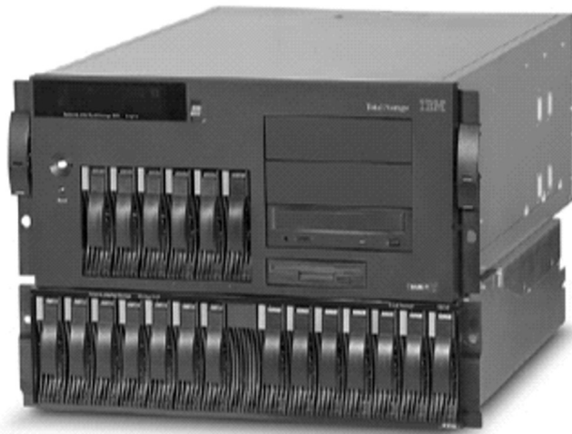
IBM NAS 300G Supported Protocol: NFS, HTTP, FTP, CIFS Netware