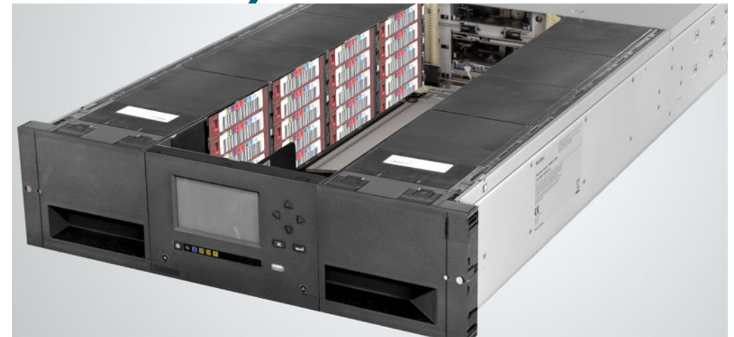
Tape Library (3U/720TB)