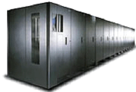
IBM TotalStorage Ultrium Scalable Tape Library 3583 規格一覽表